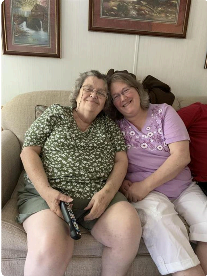
Mother & daughter